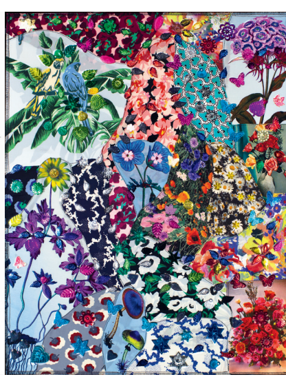
Prune Nourry - Fanta Diakité